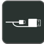
Flexible and Fast Plug-and-Play