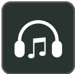
High-Quality Audio Experience