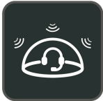
1-Mic & AI Noise Cancellation

The Yealink UH42, available in monaural and binaural, is a professional USB wired headset with crystal clear audio. The UH42 offers a lightweight, comfortable form, even for an entire workday. It's suitable for workers who spend a lot of time wearing headsets for voice communications.