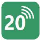
Twenty Simultaneous Calls

Yealink DECT technology focuses on high-quality Audio VoIP (wideband) and low-bit-rate data applications. However, we are not compatible with third-party DECT devices (base station, handset, etc.).