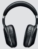
MB 660 UC MS