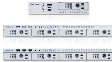
HD Video Appliances