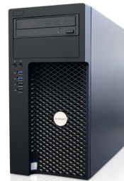
HD NVR Workstation